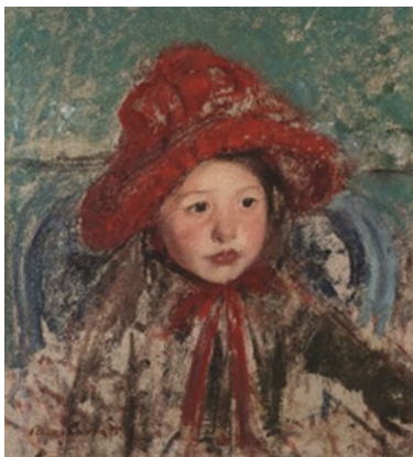
Mary Cassatt (1844-1926), "Little Girl in a Large Red Hat," ca. 1881. Oil on Canvas, 43.8 x 38.7cm. Princeton University Art Museum. Museum purchase, Fowler McCormick, Class of 1921, Fund (2021.12)